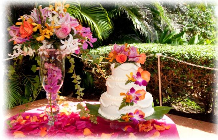
Photo Courtesy of Images by Liz, Event Design by Esjoli Chappylarnes, Flower Design Courtesy of Blue Orchid

Finish off your special day with a Beach House special occasion cake made by our in house Pastry Chef. The Beach House special occasion cakes are finished with Butter Cream icing. Fresh flowers can be added starting at $45 & are available upon request. Please contact us for any special requests.